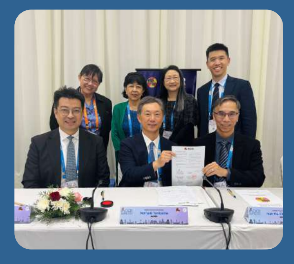
#Team HK - We look forward to welcoming everyone in AOCR 2028!

A big thank you to all the contributors and I hope you will enjoy this issue as much as I do!